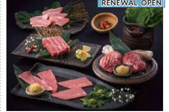
RENEWAL OPEN Main Building 11F Japanese food

■Phone:06-6770-2453 ■Budget:Lunch ¥650 / Dinner ¥1,000