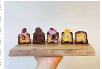
Main Building 1F Sweets / Side dishes / Grocery