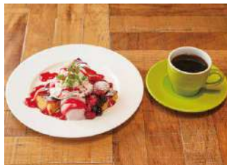
Plaza Building 1F Café

■Phone:06-6777-1225 ■Budget:All day ¥5,000