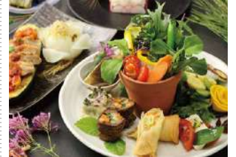
Main Building 1F Sweets / Side dishes / Grocery