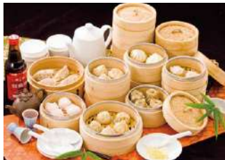
Main Building 11F Buffet