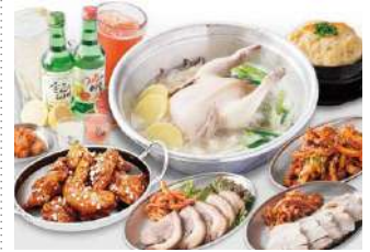
Plaza Building M2F Chinese and Korean food

■Phone:06-6770-1223 ■Budget:Lunch ¥1,050 / Dinner ¥1,500