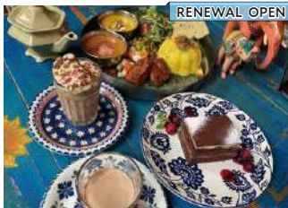
Main Building 11F Café

■Phone:06-4305-7378 ■Budget:Lunch ¥1,000 / Dinner ¥1,200