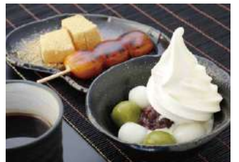
Main Building 10F Café