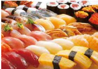
Plaza Building M2F Izakaya / Bar

■Phone:06-6777-4613 ■Budget:Lunch ¥1,500 / Dinner ¥2,500