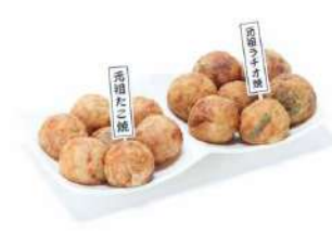
Plaza Building M2F Japanese food