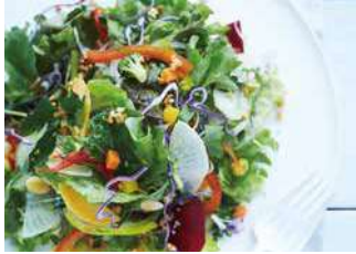
Plaza Building 1F Sweets / Side dishes / Grocery