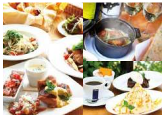
Parking Building 1F Western food

■Phone:06-6770-1163 ■Budget:All day ¥1,100~