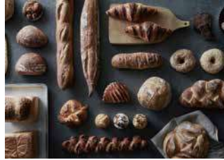
Main Building 1F Bakery