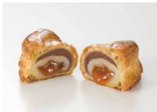
Main Building 1F Café