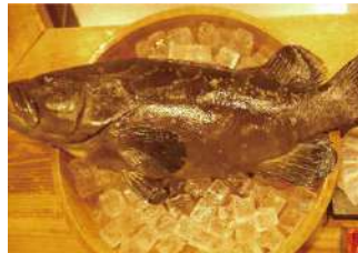
Plaza Building M2F Izakaya / Bar

■Phone:06-6796-7788 ■Budget:Lunch ¥1,000 / Dinner ¥2,500