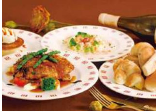
Main Building 10F Western food