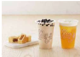
Plaza Building M2F Sweets / Side dishes / Grocery