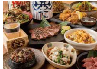
Main Building 11F Izakaya / Bar

Phone:06-6770-1233 Budget:All day ¥1,000