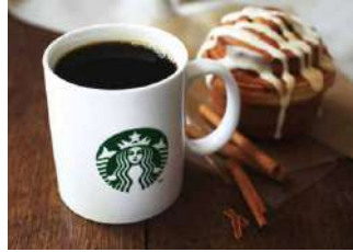
Main Bldg 3F·8F Plaza Building 4F Café