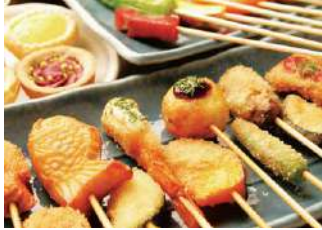
Main Building 10F Buffet