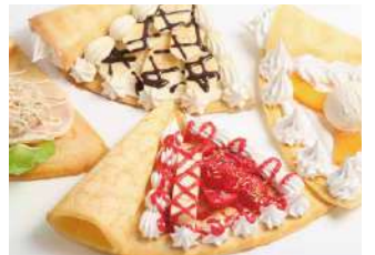
Main Building 6F Café