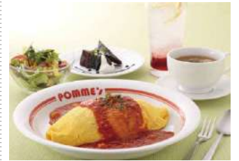
Plaza Building 4F Western food

■Phone:06-6770-1122 ■Budget:All day ¥980