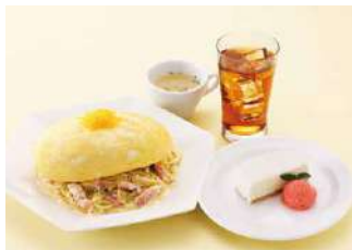
Main Building 10F Western food

■Phone:06-6773-2168 ■Budget:Lunch ¥1,000 / Dinner ¥1,300