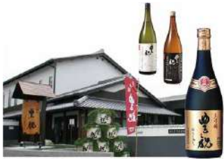
Plaza Building M2F Izakaya / Bar

■Phone:06-6718-5268 ■Budget:Lunch ¥800 / Dinner ¥2,000