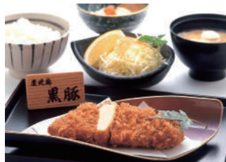
Plaza Building 4F Japanese food