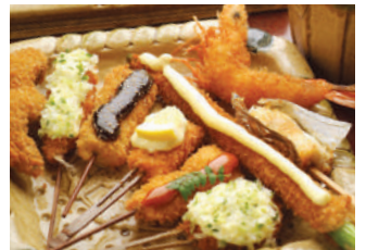
Main Building 11F Japanese food