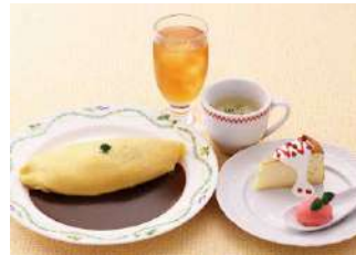
Main Building 10F Western food

■Phone:06-6776-9115 ■Budget:Lunch ¥1,000 / Dinner ¥1,500