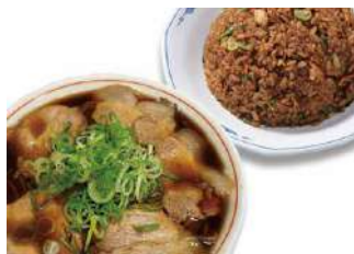
Main Building 10F Noodles

Phone:06-6796-8107 Budget:All day ¥1,000