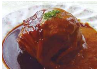
Plaza Building 4F Western food

■Phone:06-6770-2471 ■Budget:Lunch ¥1,400 / Dinner ¥1,650