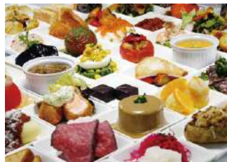
Main Building 1F Sweets / Side dishes / Grocery