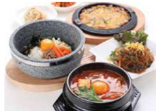
Plaza Building 4F Chinese and Korean food

■Phone:06-6779-0606 ■Budget:Lunch ¥1,000 / Dinner ¥2,200