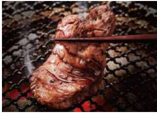
Main Building 10F Japanese food

■Phone:06-6770-1225 ■Budget:Lunch ¥1,500 / Dinner ¥4,000