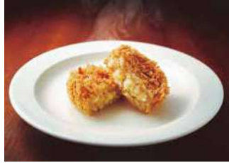
Plaza Building 1F Sweets / Side dishes / Grocery