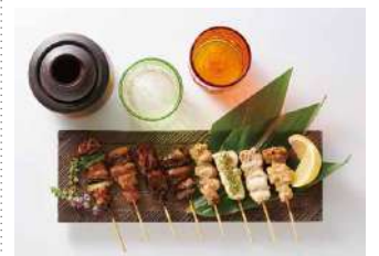
Plaza Building M2F Izakaya / Bar

Phone:06-6718-4513 Budget:Lunch ¥1,000 / Dinner ¥3,000