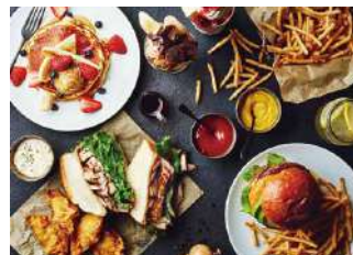
Plaza Building 2F Café