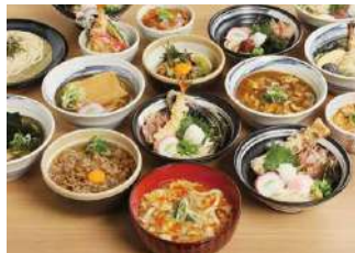
Main Building 10F Noodles

Phone:06-6772-8111 Budget:All day ¥1,300