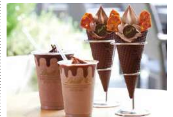
Plaza Building 2F Café

■Phone:06-6773-3016 ■Budget:All day ¥1,000~¥1,500