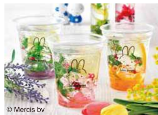
Main Building 6F Sweets / Side dishes / Grocery