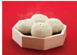
Main Building 1F Sweets / Side dishes / Grocery