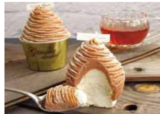
Main Building 1F Sweets / Side dishes / Grocery