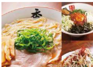
Main Building 10F Noodles

Phone:06-6770-2444 Budget:Lunch ¥950 / Dinner ¥2,000~¥3,000