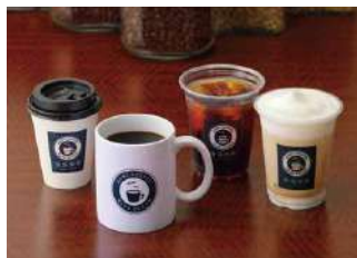
Main Building 11F Café

■Phone:06-6777-5677 ■Budget:All day ¥1,000~