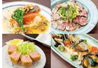
Plaza Building M2F Izakaya / Bar