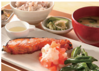
Plaza Building M2F Japanese food

■Phone:06-6770-1194 ■Budget:Lunch ¥1,200 / Dinner ¥3,000~