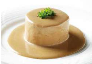
Plaza Building M2F Izakaya / Bar