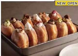
Plaza Building M2F Sweets / Side dishes / Grocery