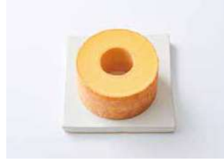
Main Building 1F Sweets / Side dishes / Grocery