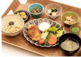
Plaza Building 4F Japanese food

■Phone:06-6105-3690 ■Budget:Lunch ¥1,200 / Dinner ¥3,000