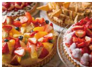
Main Building 1F Sweets / Side dishes / Grocery