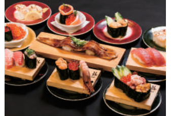
Plaza Building 4F Japanese food