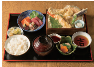
Main Building 11F Japanese food