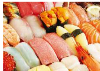
Plaza Building B1 Sweets / Side dishes / Grocery