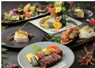
Main Building 11F Japanese food

■Phone:06-6772-3446 ■Budget:Lunch ¥1,430~/ Dinner ¥2,500~