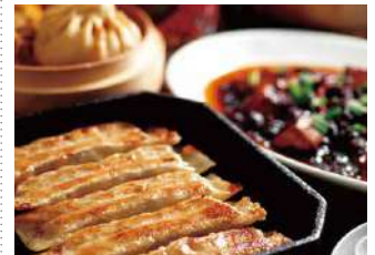
Main Building 11F Chinese and Korean food

■Phone:06-6776-7411 ■Budget:Lunch ¥1,000 / Dinner ¥1,500