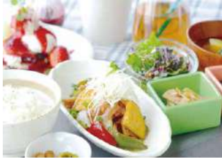
Main Building 10F Café