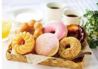
Plaza Building 1F Sweets / Side dishes / Grocery