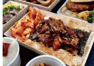
Main Building 1F Sweets / Side dishes / Grocery