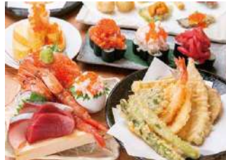
Plaza Building M2F Izakaya / Bar

■Phone:06-6776-8220 ■Budget:All day ¥2,700