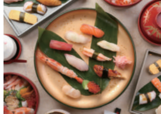
Main Building 11F Japanese food