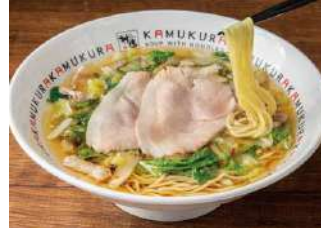
Plaza Building 4F Noodles