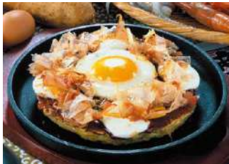
Main Building 10F Japanese food

■Phone:06-4392-7338 ■Budget:Lunch ¥1,000 / Dinner ¥2,000