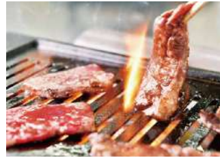
Plaza Building M2F Japanese food

■Phone:06-4305-1129 ■Budget:Lunch ¥1,500 / Dinner ¥2,000