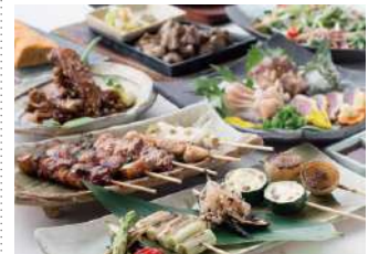
Main Building 11F Izakaya / Bar

Phone:06-6770-2456 Budget:Lunch ¥1,000 / Dinner ¥2,000~¥3,000