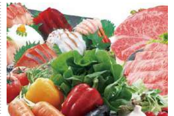
Plaza Building B1 Sweets / Side dishes / Grocery