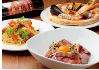
Main Building 10F Noodles

Phone:06-6770-1133 Budget:Lunch ¥1,100 / Dinner ¥1,200