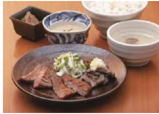
Plaza Building 4F Japanese food

■Phone:06-6770-1165 ■Budget:All day ¥1,500