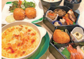
Plaza Building 4F Japanese food