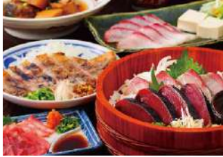
Plaza Building 4F Japanese food