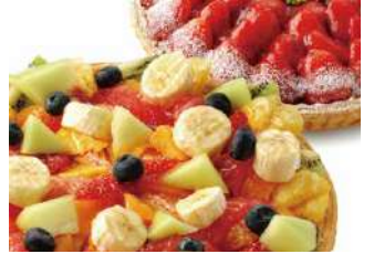
Main Building 4F Café

■Phone:Main Bldg. 3F/06-6776-2548 Main Bldg. 8F/06-6776-7036 Plaza Bldg. 4F/06-6776-7706