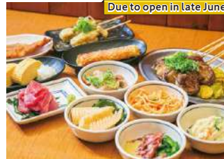
Plaza Building B1 Izakaya / Bar

■Phone:06-6777-2422 ■Budget:Lunch ¥1,000~¥1,500 / Dinner ¥2,500