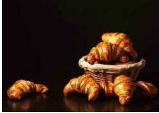
Main Building 1F Bakery