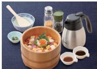
Plaza Building 4F Japanese food