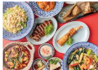
Plaza Building M2F Chinese and Korean food

■Phone:06-6770-1230 ■Budget:Lunch ¥900 / Dinner ¥1,400