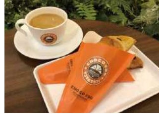
Plaza Building M2F Café

■Phone:06-6770-1213 ■Budget:All day ¥540~¥1,400