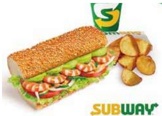
Plaza Building M2F Sweets / Side dishes / Grocery