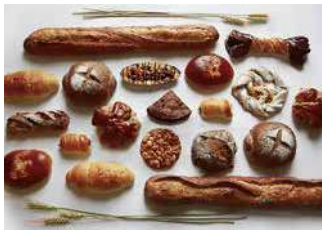
Plaza Building B1 Bakery