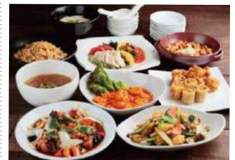
Plaza Building 4F Chinese and Korean food

■Phone:06-6770-2419 ■Budget : Lunch ¥900 / Dinner ¥2,700