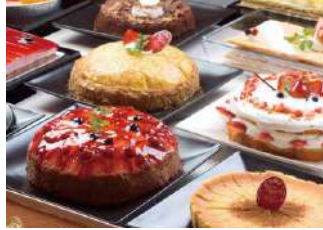
Main Building 11F Buffet

■Phone:06-6770-2439 ■Budget:Lunch ¥1,700 / Dinner ¥2,400