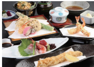
Main Building 11F Japanese food