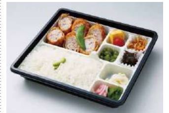
Plaza Building B1 Sweets / Side dishes / Grocery