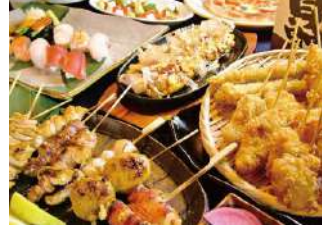
Plaza Building B2 Izakaya / Bar