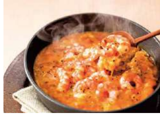
Main Building 11F Western food

■Phone:06-6770-1289 ■Budget:Lunch ¥1,000~/ Dinner ¥1,500~