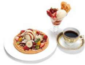
Main Building 10F Café

■Phone:06-6770-2432 ■Budget:Lunch ¥1,200 / Dinner ¥1,900