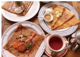
Main Building 2F Café

*9:00~21:00 (Inside the JR Tennoji Sta.) ■Phone:06-6776-0733