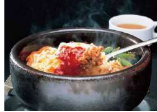
Main Building 10F Chinese and Korean food