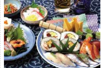
Plaza Building 4F Izakaya / Bar