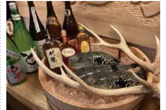
Plaza Building 4F Izakaya / Bar

■Phone:06-6773-8548 ■Budget:Lunch ¥1,000 / Dinner ¥2,000