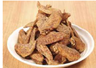
Plaza Building 4F Izakaya / Bar

■Phone:06-6774-2931 ■Budget:Lunch ¥900 / Dinner ¥2,500