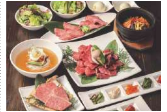
Plaza Building 4F Japanese food

■Phone:06-6776-8599 ■Budget:All day ¥3,000~