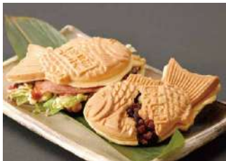
Plaza Building 1F Sweets / Side dishes / Grocery