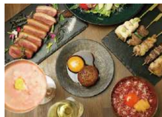
Plaza Building 4F Izakaya / Bar