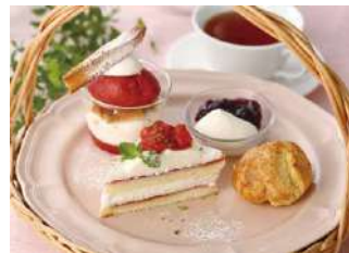
Plaza Building 3F Café

■Phone:06-6773-3017 ■Budget:All day ¥950