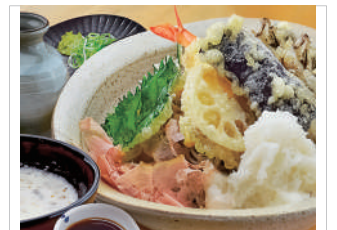
Plaza Building 4F Japanese food