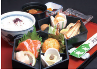
Main Building 10F Japanese food