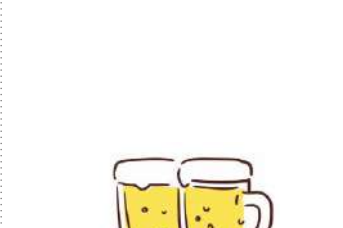
Plaza Building 4F Izakaya / Bar

■Phone:06-6776-6711 ■Budget:All day ¥3,000