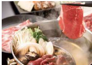
Plaza Building 4F Buffet

■Phone:06-6772-6309 ■Budget:Lunch ¥1,800 / Dinner ¥2,100