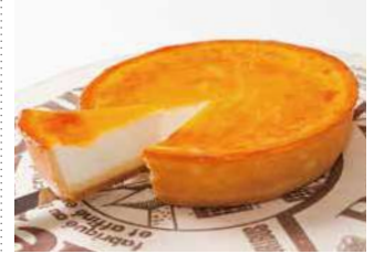
Main Building 1F Sweets / Side dishes / Grocery