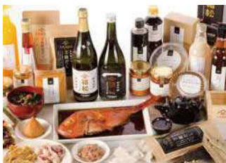
Plaza Building M2F Sweets / Side dishes / Grocery