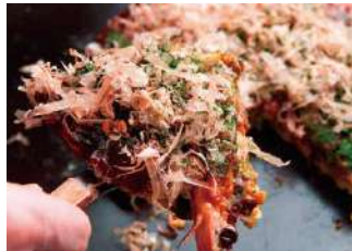
Plaza Building 4F Japanese food

■Phone:06-6770-1208 ■Budget:Lunch ¥1,000 / Dinner ¥1,500