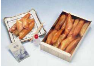
Plaza Building B1 Sweets / Side dishes / Grocery