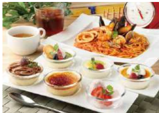
Plaza Building M2F Noodles