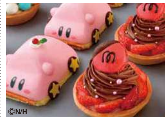
Main Building 6F Sweets / Side dishes / Grocery