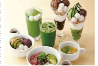
Plaza Building M2F Café

■Phone:06-6774-4309 ■Budget:All day ¥600