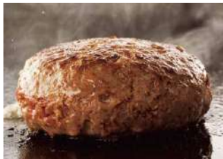
Main Building 10F Western food

■Phone:06-6770-1305 ■Budget:Lunch ¥1,100 / Dinner ¥1,200