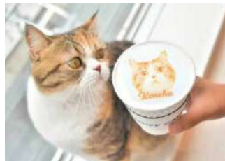
Main Building 6F Café

■Phone:06-6770-1274 ■Budget:All day ¥1,260~