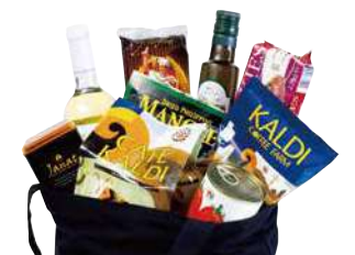
Plaza Building B1 Sweets / Side dishes / Grocery