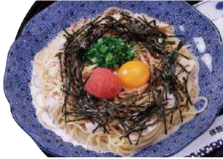
Main Building 10F Noodles