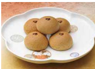
Main Building 1F Sweets / Side dishes / Grocery